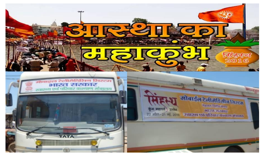
Fig.1: Mobile telemedicine Van at Simhastha Kumbh Mela at Ujjain