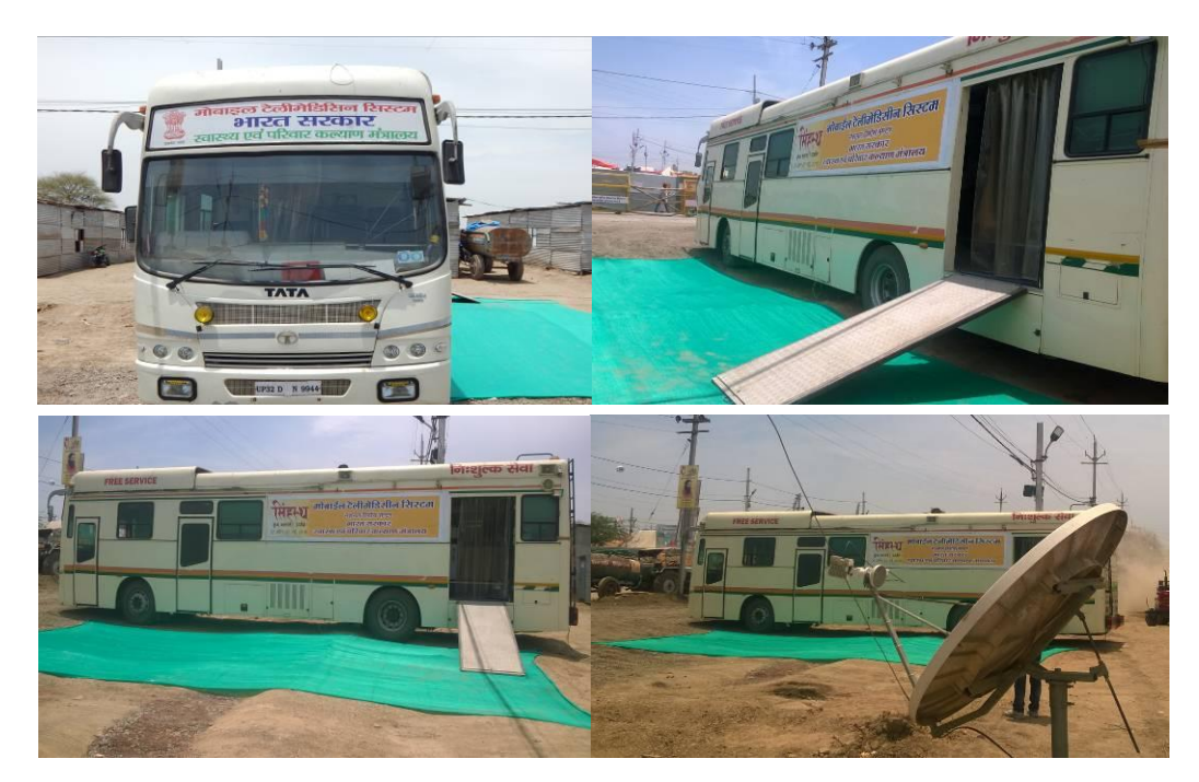
Fig.3: Mobile Telemedicine Van at Simhastha Kumbh Mela at Ujjain